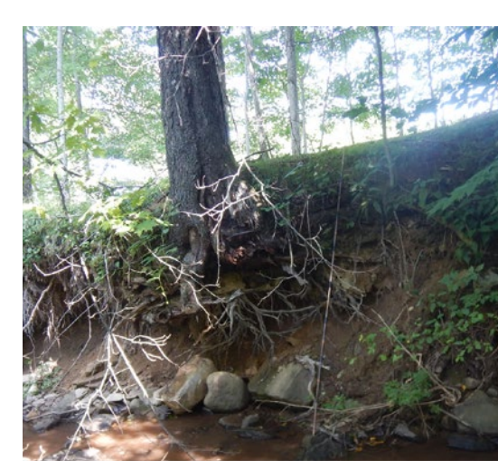
Erosion areas such as this one documented during the creek assessment carry large amounts of sediment downstream and further destabilize the creek bank.

Since its founding in 1988, the Otsego Land Trust has protected over 11,000 acres, of which 10,000 of that is in conservation easement. OLT also preserves land for public access. Its flagship property, Brookwood Point in