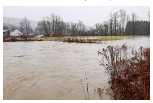
In extreme instances, erosion can lead to severe flooding such as occcurred near Olds Road this past Christmas Day rainstorm.

"We have all of these really large goals for the Chesapeake Bay. In New York state, for the watershed implementation plan, those goals are thousands upon thousands of riparian forest buffer. Realistically we can't get to that goal without engaging the entire community within the Chesapeake Bay headwaters in New York state," said Lydia.